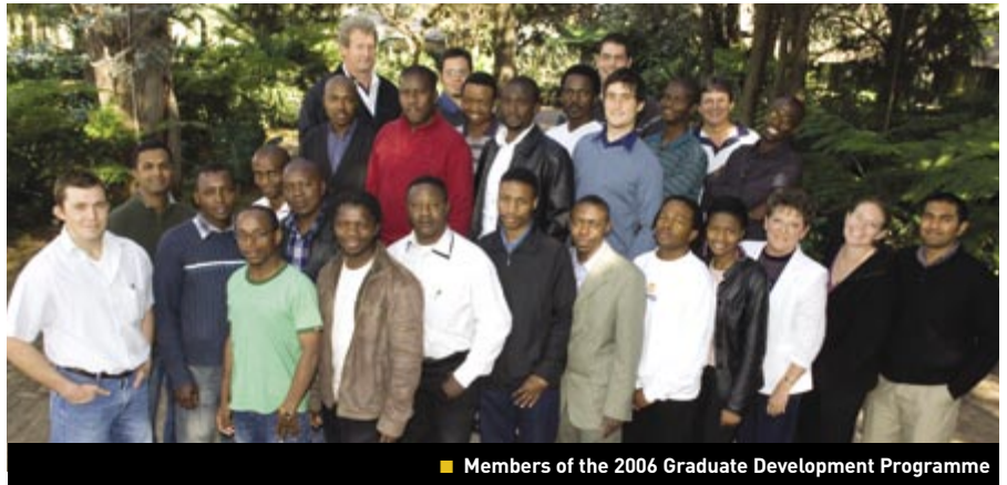
■ Members of the 2006 Graduate Development Programme

A Campus Engagement Initiative has been implemented to enhance the relationships between the Group and relevant university faculties and their