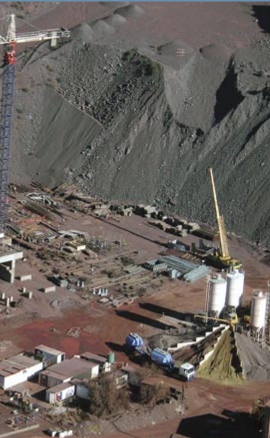
■ Sishen Expansion Project

Xstrata Coal is the world's largest producer of export thermal coal and has interests in 32 coal mines in Australia and South Africa and an exploration project in Canada. ○